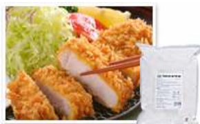
TONKATSU BATTER MIX