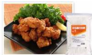
KARA-AGE BATTER MIX (FRIED CHICKEN MIX)