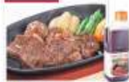
BLACK PEPPER SAUCE