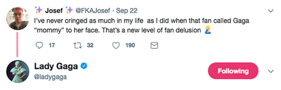
Replying to @FKAJosef

I called myself mother monster for a long time+ still do, it's not uncommon or delusional. My fans are unique + our bond is too