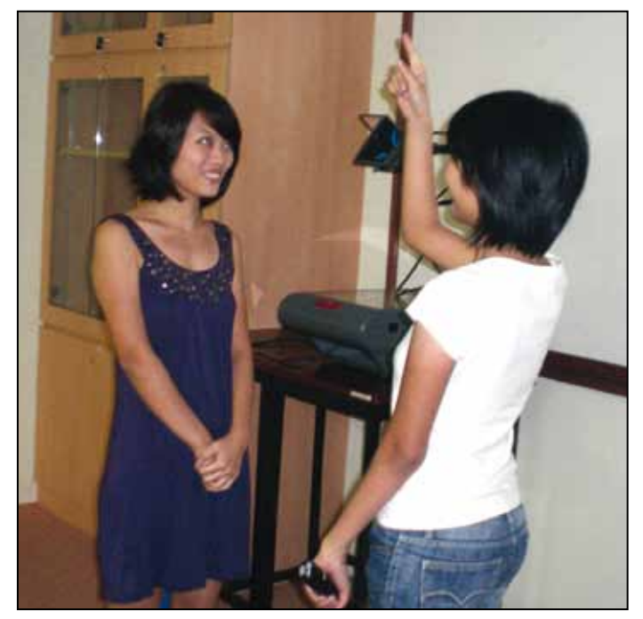
Students conduct simple neurological exams on one another during the lesson.