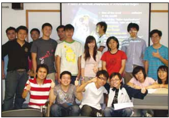
Freshmen who took FMC1202 give the course the thumbs up!

and the exchange of ideas between students and lecturers. Students contribute to the class by blogging and giving presentations about what they learnt from the seminars and from their follow-up explorations.